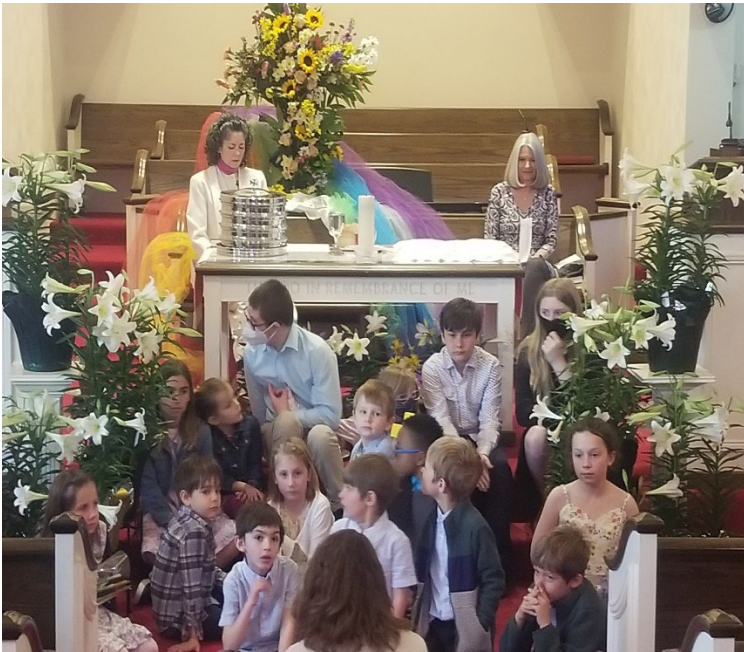
Easter Sunday, the children gather for the Children's message. What a joy to see so many children participating in the worship service.