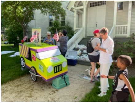
Getting ready to head out for the parade